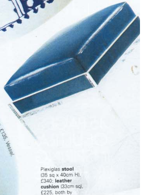
Plexiglas stool (35 sq x 40cm H), £340; leather cushion (33cm sq), £225, both by Nada Debs, Mint