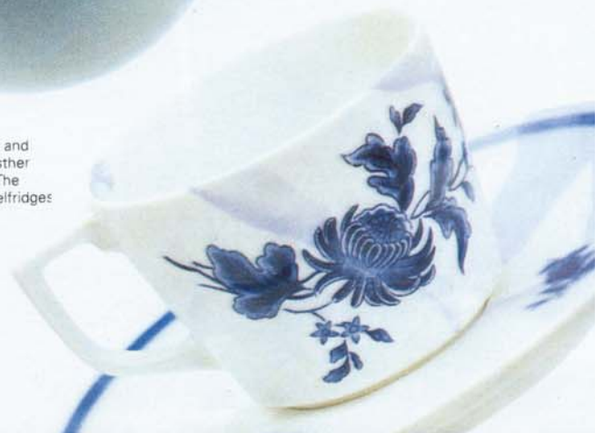
Ceramic cup and saucer by Esther Derkx, £25, The Lounge at Selfridges