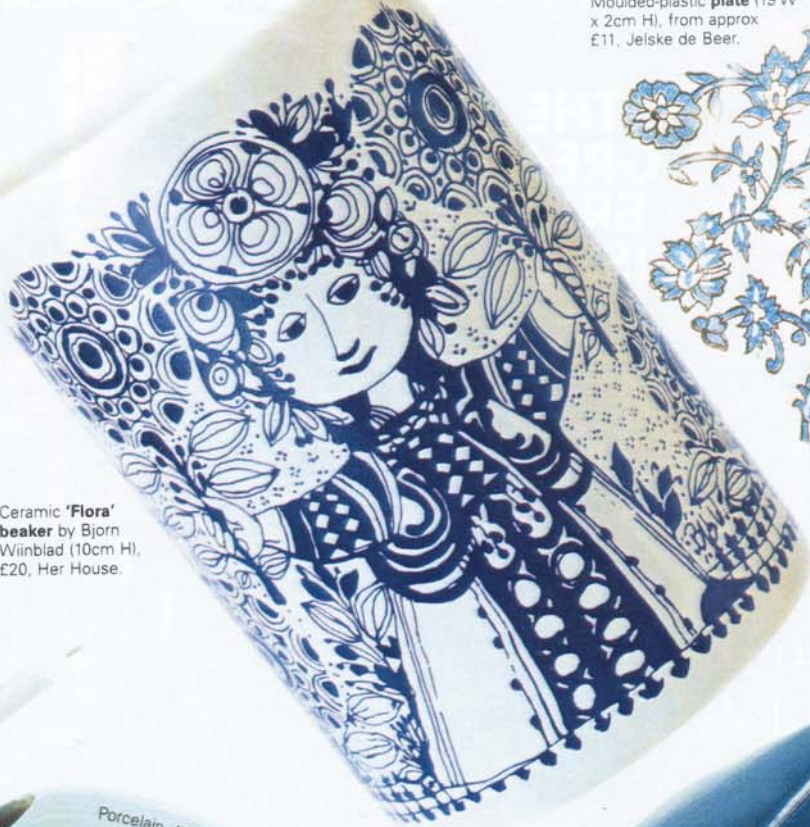
Ceramic 'Flora' beaker by Bjorn Wiinblad (10cm H), £20, Her House