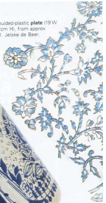
Moulded-plastic plate (19 W x 2cm H), from approx £11, Jelske de Beer