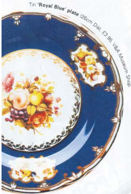
Tin 'Royal Blue' plate (26cm Dia), £3.95, V&A Museum Shop